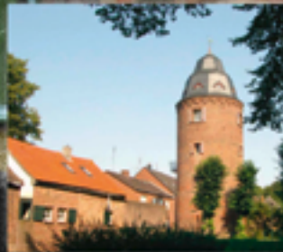
Mühlenturm (Mill Tower)