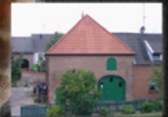
Stadtscheune (Town Barn)

Contact: Tourist Info Center Alter Bahnhof Bahnhofstr. 15 47559 Kranenburg phone: 0 28 26/79 59 e-mail: touristik@kranenburg.de