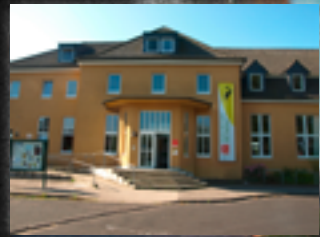
Former railway station